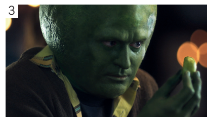
1 Nike, Together 2 Jordan, Love The Game 3 Justin Timberlake as Rick 'Sour' Vane in No Limes Needed for Sauza 901